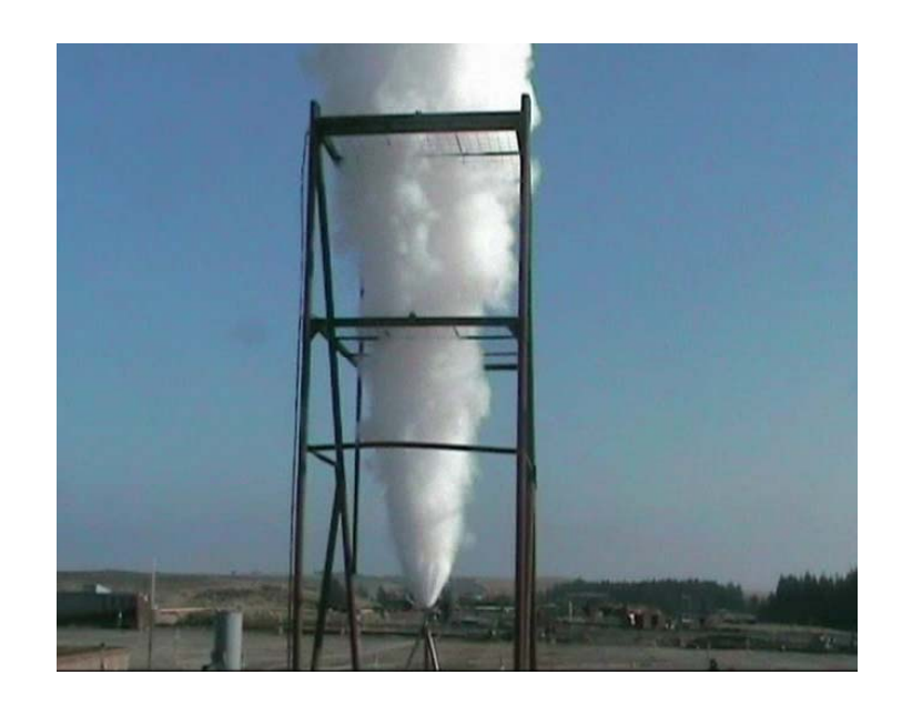
Figure 2 Vertical vent release experiment