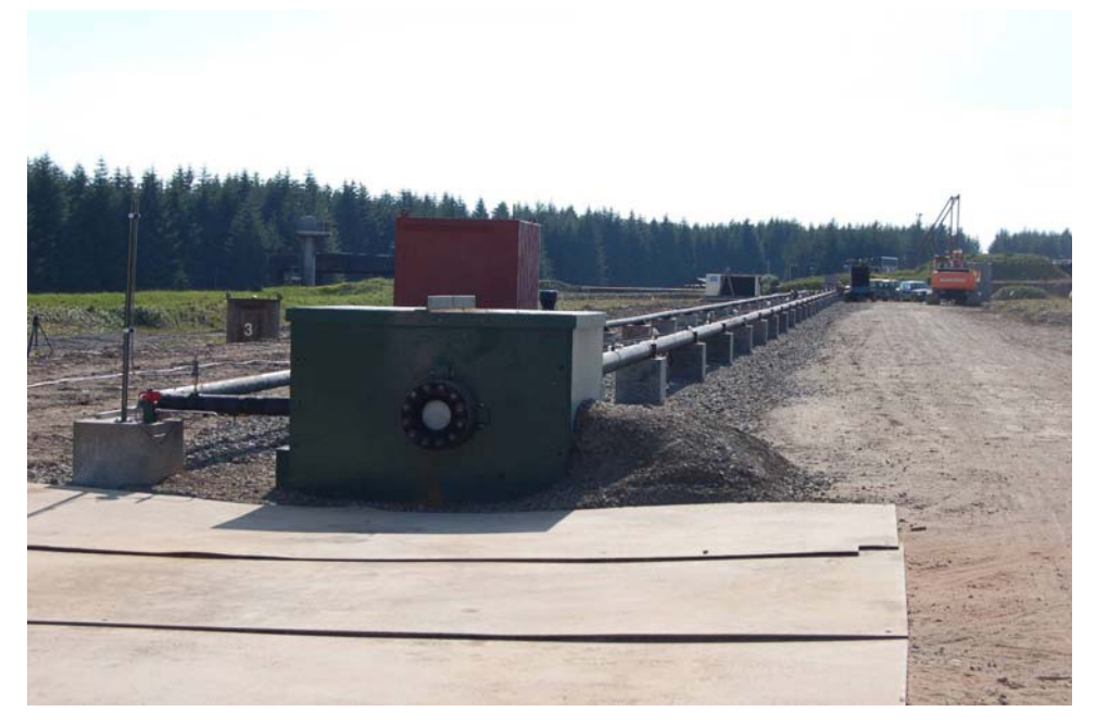
Figure 3 Photo of the shock tube test rig

In the plume produced by the shock tube releases, measurements were made of the temperature, concentration and flow velocity, in order to study how such a highly transient release behaves, i.e. whether it exhibits behaviour similar to a steady plume or an instantaneous "puff". The effect of localised topographical features on the dispersion behaviour was also studied by performing tests across either open, flat terrain, or across terrain that was sculpted into mounds and/or surface depressions.